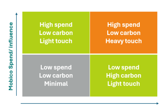
High Carbon Emitting